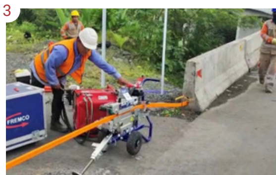
DuctRod RAPID in use pushing the micro duct into the concrete barrier a distance of 280m/306yds