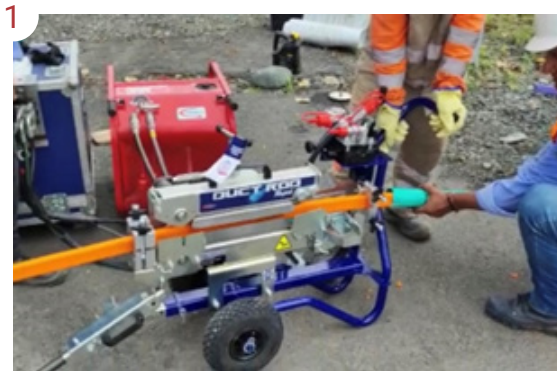
DuctRod RAPID set up with micro duct between chains.

In Columbia, a micro duct was pushed into a concrete barrier using the DuctRod RAPID. It has been proven that if you were to complete the task by hand, it would be difficult and time-consuming and might have required three times as much manpower.