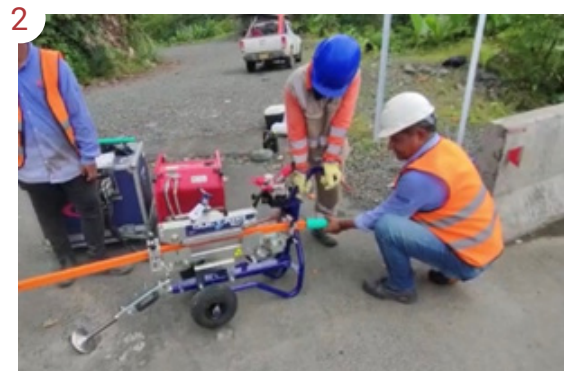
DuctRod RAPID set up with micro duct between chains being guided into the barrier by a technician.