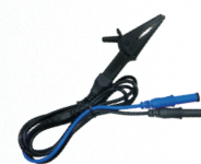
AL-33B Special Resistance Test Lead