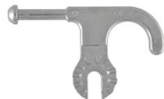
HOK-HS166 Disconnect hook (Optional)