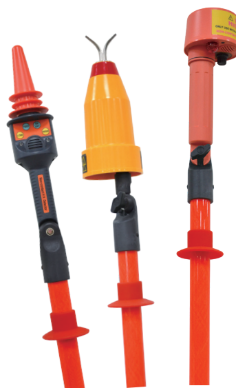
Attached to the High Voltage Proximity Detectors and Contact Capacitive Detectors