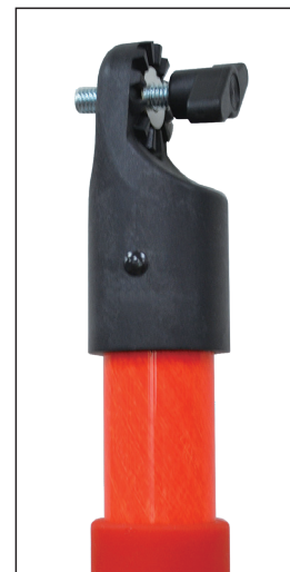
Universal Sunrise Fitting head