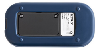
Rear view, screw-on battery compartment cover