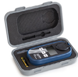
Transport and storage case